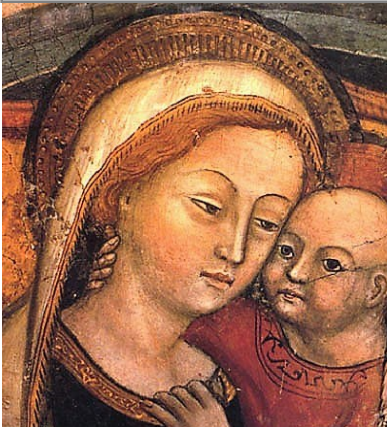
Our Lady of Good Counsel

We would like to offer our parishioners the opportunity to identify family members who are first responders. We owe them a lot, so let's keep them in our prayers. Send their name, branch of service, and rank to: pjwlmg@gmail.com